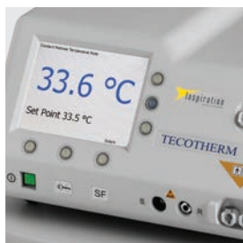
Stand by screen is easy to see across the room.