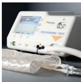
A lightweight and portable device, the Tecotherm Neo is the gold standard in Total Body Cooling.