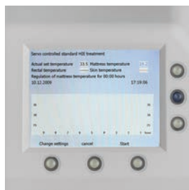
Clinician can set the duration of treatment, the rate of cooling / warming as well as the target temperature.