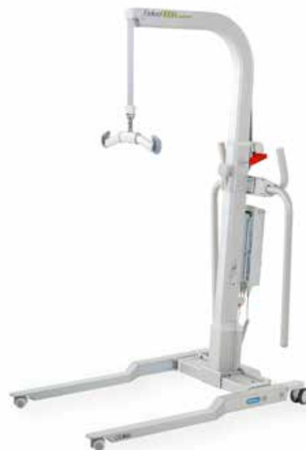
Golvo 9000 LowBase

The Golvo 9000 lift offers the functional advantages of an overhead lift with the flexibility of a mobile lift. In combination with the extensive range of Liko accessories, Golvo is ideal for common lifting situations across a variety of care environments.