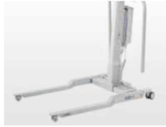
LowBase - Base height