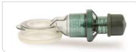
Exhaust Collector W195-004 - PEEP Valve W195-005