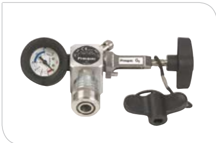
O2 Pin Index Regulator - 500-A162/CE For other configurations please contact your local supplier