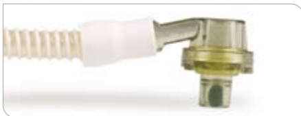
Hose W1730 - Valve 510A2957 for DEMAND type ventilator