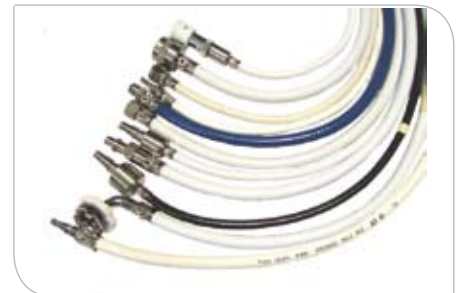
Probes For part numbers refer to user manual