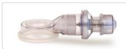
Exhaust Collector W1434 - PEEP Valve W1433