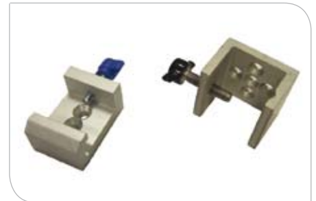
Rail and Pole Mounting Brackets - 500-A4843 (Rail) - 500-A4844 (Pole)