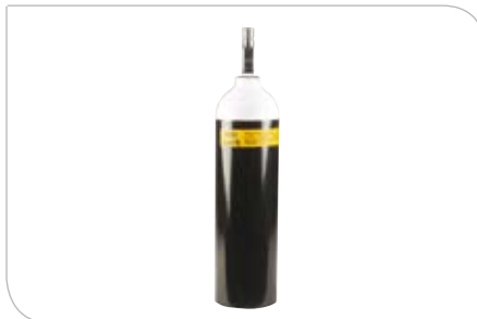
D size Aluminium Cylinder - W6838 For other variants please contact your local supplier