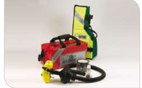
Small Carrying bag for cylinder and deployment kit 520-1154 CBRN Circuit and filter kit (Red bag) 520A1222NGB UK VR1™ AIR MIX Version VR1AIRNGB