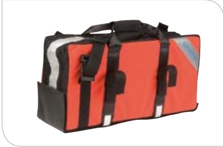
PAC and Cylinder Bag - W1230