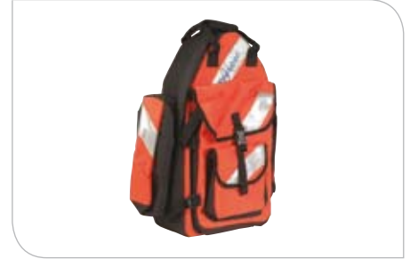
Rucksack - W1228