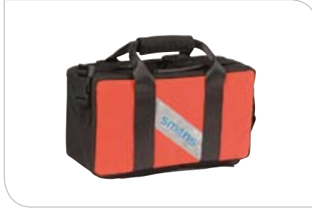
PAC Bag - W1231