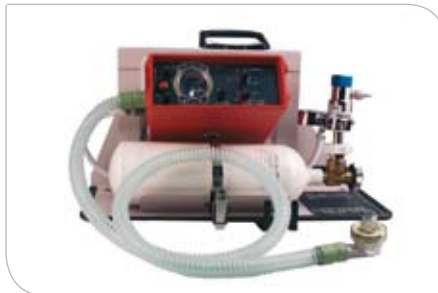
Mini Carry PAC - 510A2406 (Ventilator and Accessories not included)