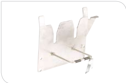
Ambulance Mounting System - 510A1710