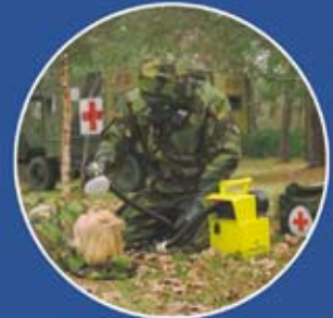
Difficult & Taxing Environments

The causes of breathing failure are many, but commonly include: