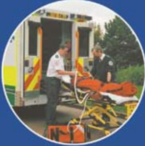
Pre-Hospital (Advanced Life Support)