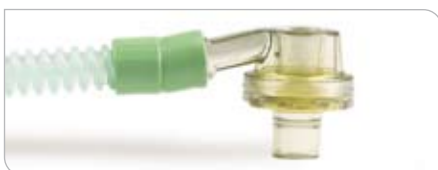
Hose W7486 (Silicone) Valve - 510A2957 for DEMAND type ventilator