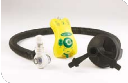
VR1AIRNGB and CBRN circuit (Shown without bag)