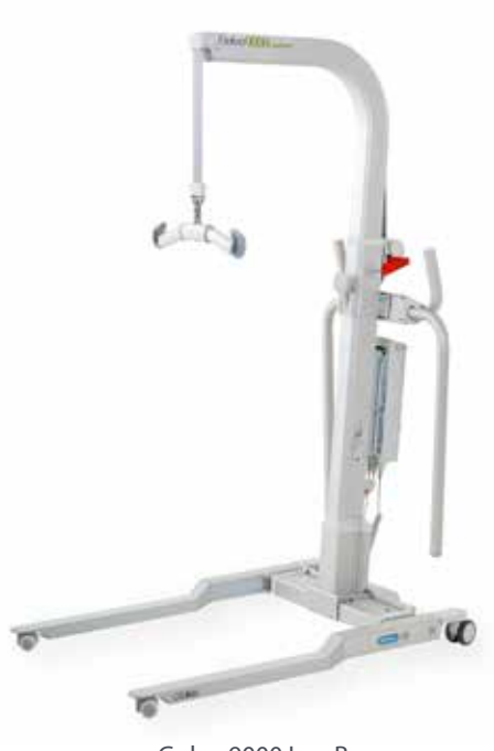
Golvo 9000 LowBase

The Golvo 9000 lift offers the functional advantages of an overhead lift with the flexibility of a mobile lift. In combination with the extensive range of Liko accessories, Golvo is ideal for common lifting situations across a variety of care environments.