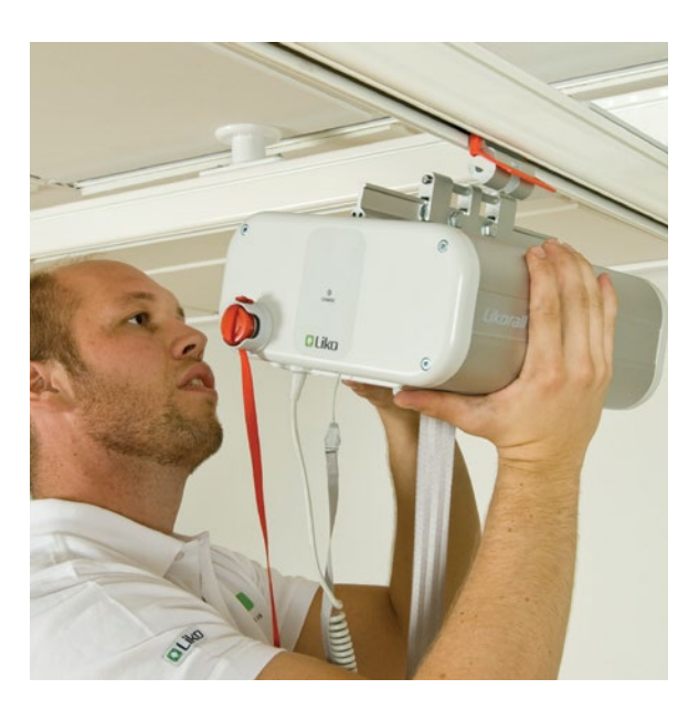
Moving the Lift Motor (excluding LR242 S and LR 242 ES)

The Quick-Release Hook™ Carriage makes it easy to move the system between rooms.